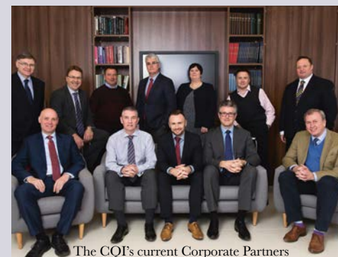
The CQI's current Corporate Partners