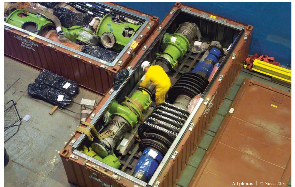
All photos | © Nuvia 2016