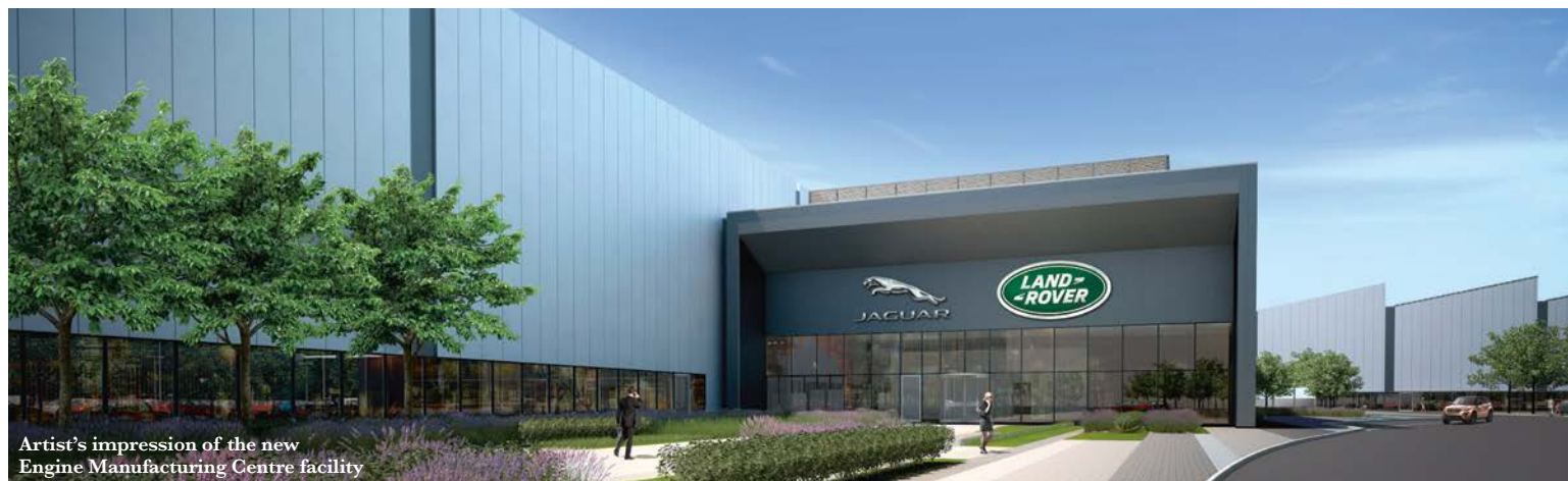
Artist's impression of the new Engine Manufacturing Centre facility